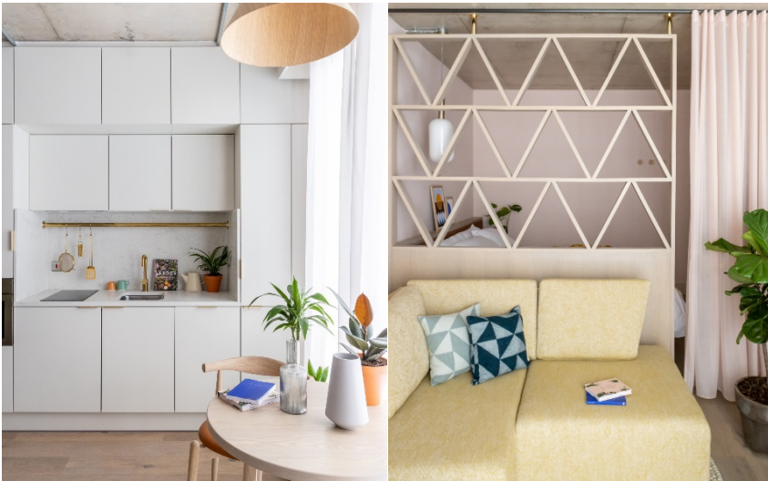
Zanzibar Locke, Ha'Penny Bridge